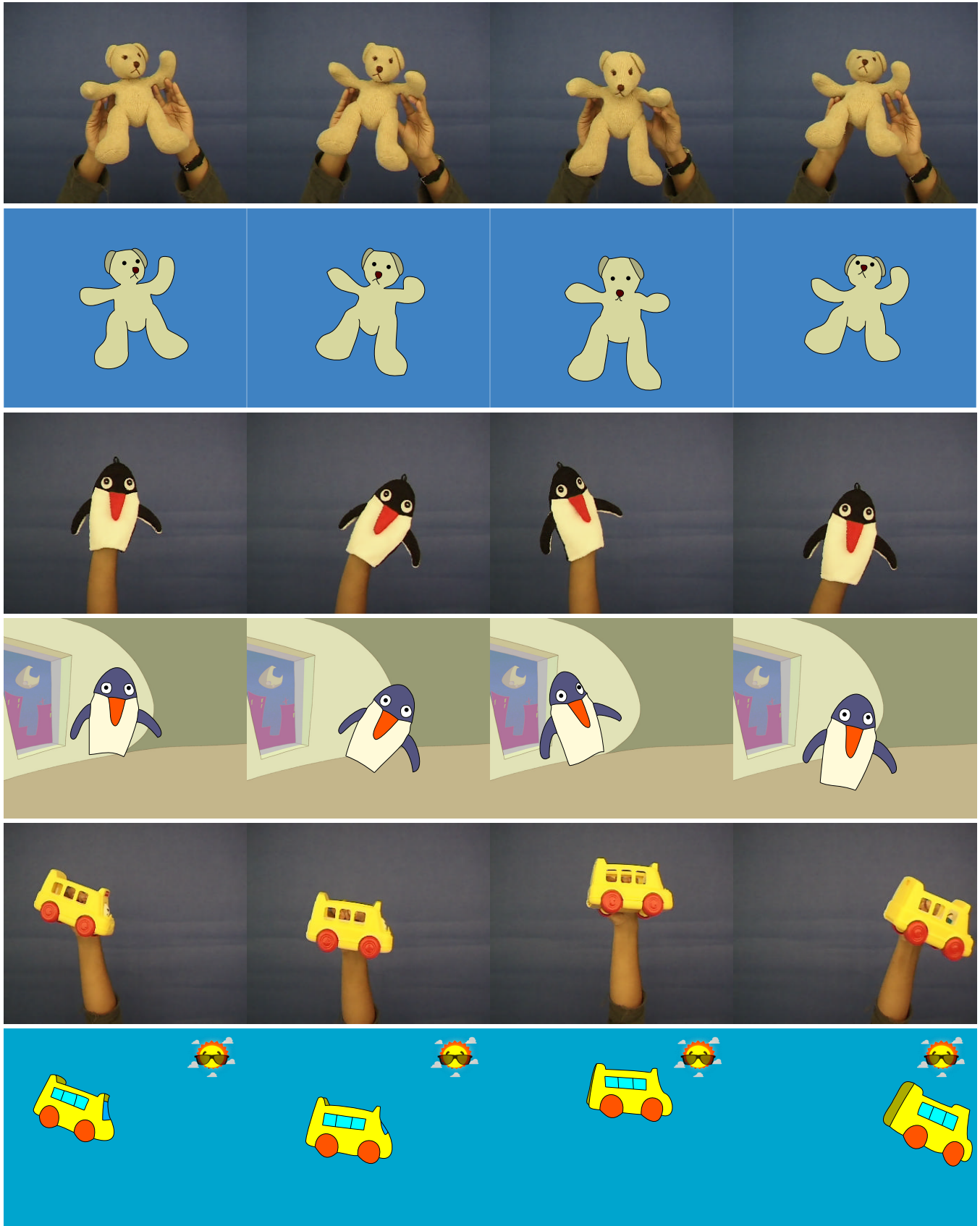
Figure 3: Several frames from four examples of animation created with SnakeToonz along with their corresponding video frames.